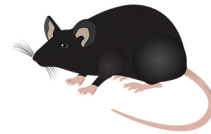
parvus, -a, -um