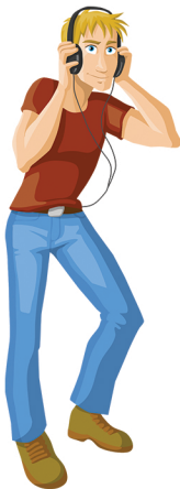
procerus, -a, -um