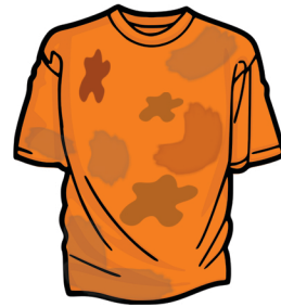
sordidus, -a, -um