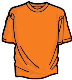
mundus, -a, -um