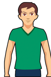
siccus, -a, -um