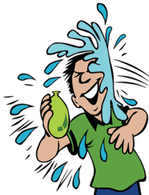
umidus, -a, -um