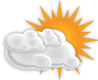
umbrosus, -a, -um