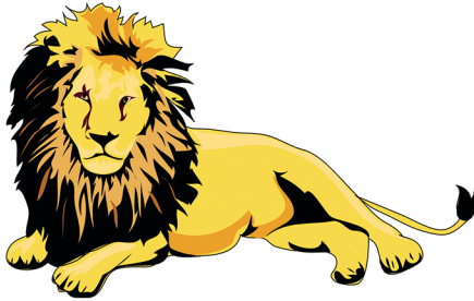
ferus, -a, -um