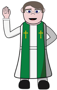
pius, -a, -um