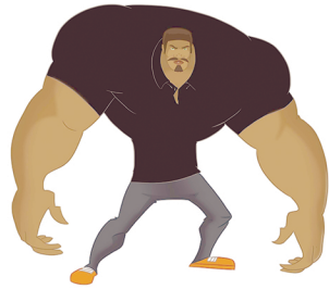
validus, -a, -um